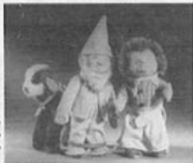
The gnomes, passed down in ownership through the decades, peer down from the middle gable of this residence.