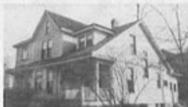
Davis residence circa 1920, when owned by the Stephenson family