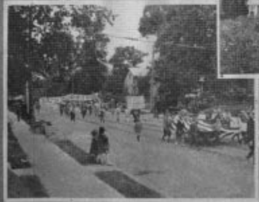
Scenes of the 1918 Field Day