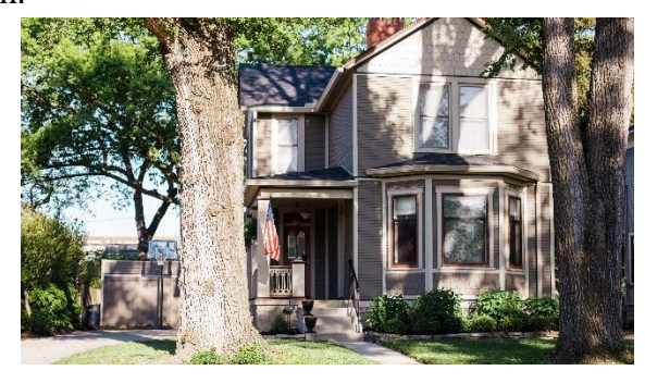
One of the six homes on the 2019 tour.

The main attraction will be six beautiful and historic homes in Grandview Heights and Marble Cliff. From a classic Bungalow to a Jacobean castle, the tour homes offer an eclectic mix of history and design. Information on ticket purchase and volunteering can be found at www.ghmchs.org/hometour2019.html. In a change from past tours, attendees will register at a common check-in location (1621 W. First Ave.) where they will receive their tour brochure. Tickets will not be sold at tour homes. The tour is designed for maximum walkability; the distance around to all tour homes is approximately 2 miles with sidewalks. flat terrain, and street parking throughout. Several lots on the tour path are open for tour parking as well.