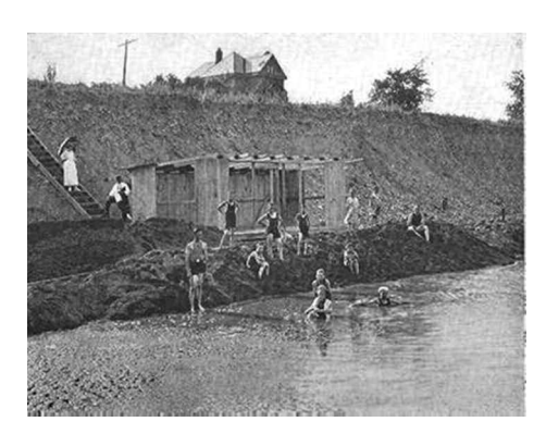
Swimming hole under construction in 1921.