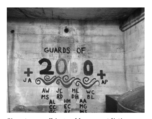
Signature wall in pool basement listing pool lifeguards for 2000 season.

Original projections were for 2,500 individual memberships to be sold the first season as a City pool in 1978; under private ownership in 1977, the pool had 1,900 members. However, 3,500 individual memberships were sold the first season, a 75% increase over the number sold the last year of private ownership. The first pool operating budget in 1978 was $40,000.