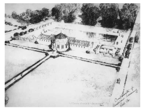
Original design drawing for Grandview Swimming Pool Co. private pool facility.