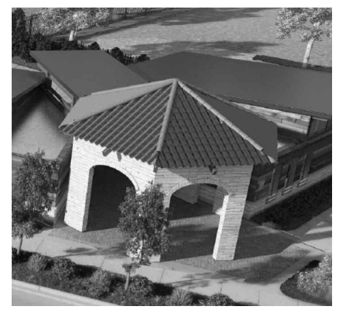
The new pool building will maintain the appearance of the original 1932 structure with a tile roof and hexagonal cupola (drawing courtesy of Grandview Parks and Recreation).