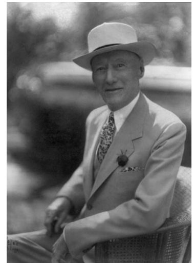
His name is on the map of Grandview. Who Is he?