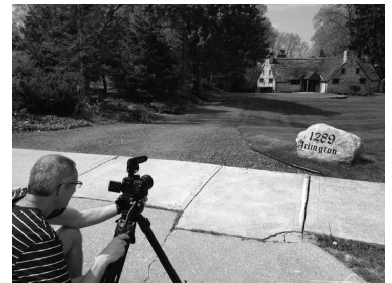
Ryan Schlagbaum videographing in Marble Cliff

love their community. Producers work on their off time, holidays, nights and weekends to get these products not just done, but done "right."