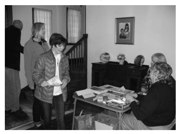
Reception desk at the Evans residence.