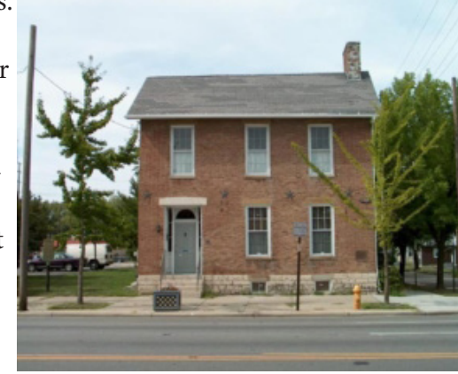
The Harrison House, dates from the early 1800s, and is one of the few original Franklinton structures still standing.

Join us on October 21 to hear more about our interesting acrossthe-Scioto neighbor! A short Society business meeting which is also open to the public will precede the featured talk.