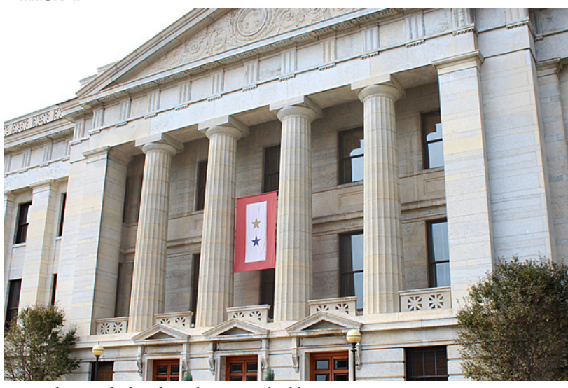
Service banner deplayed at Ohio Senate building. http://www.ohiostatehouse.org/about/capitol-square/senate-building