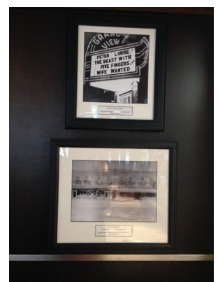
Photos displayed on wall near Cap City counter show Grandview Theater and Bank Block.

We commend these restaurants for their attention to local history. Stop by and see the Society materials on display while enjoying wonderful food and drink. The Society has also worked with the management of The Avenue, Grandview Cafe, and the Knotty Pine to place historic photos in their venues.