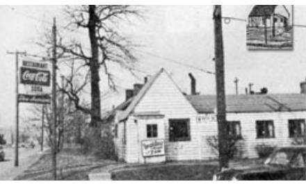
Former Stew Harrison's restaurant at Fifth/ Grandview Avenues circa 1950s (now site of Winking Lizard restaurant).