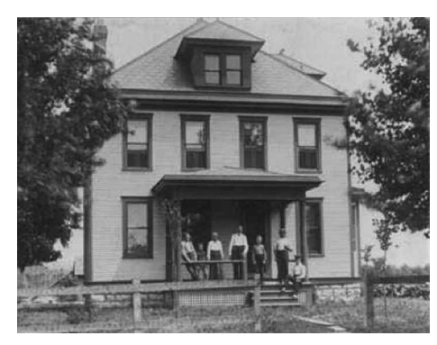
Salzgaber farmhouse circa 1910.

Clarence Salzgaber who lived in Grandview with his family in the early 1900s was one of 126 "truck farmers" in Franklin County. These farmers cultivated over 2,000 acres producing fresh vegetables for the Columbus area. The Salzgaber farm home still stands on the corner of Grandview and First Avenues.